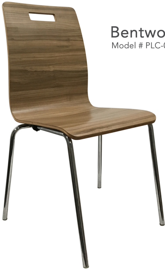
Bentwood Model # PLC-01-15