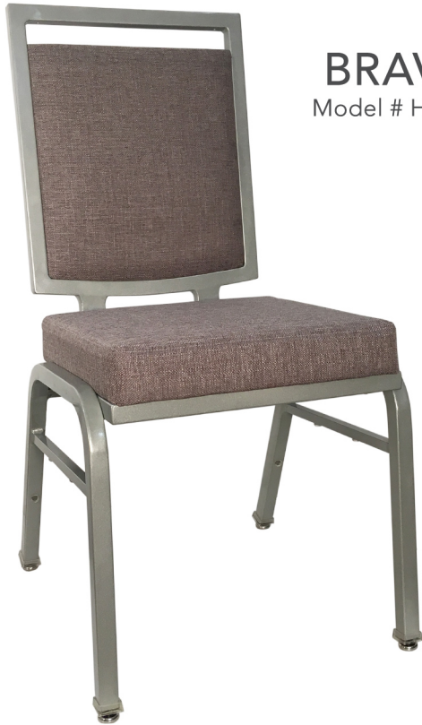
BRAVO Model # HC-808