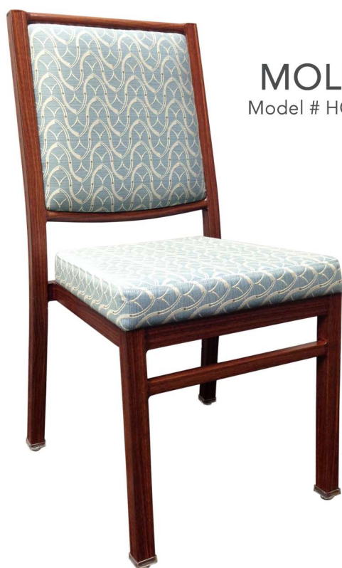
MOLLY Model # HC-737