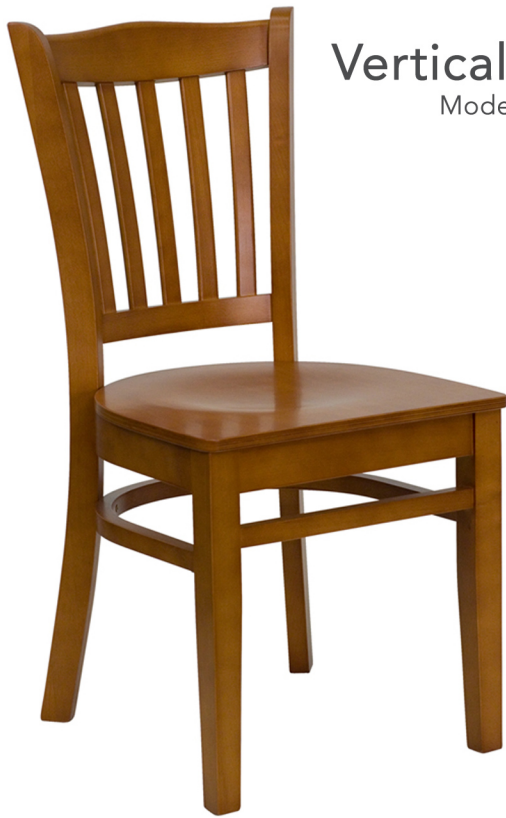
Vertical Slat Back Model # 7362-A