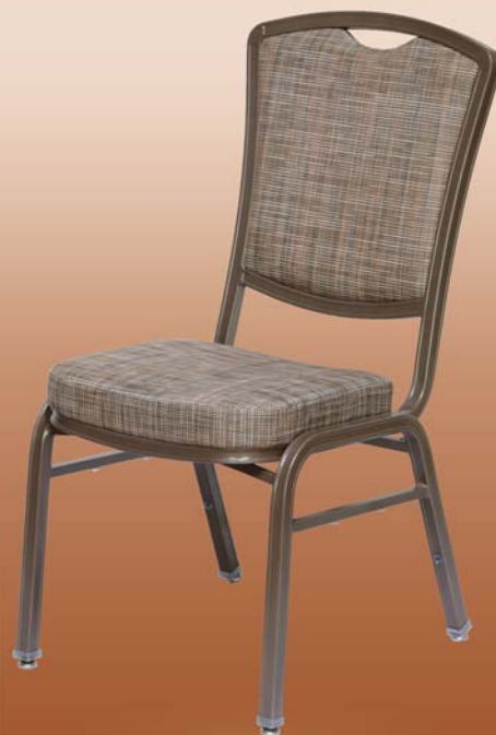
Model # HC-53